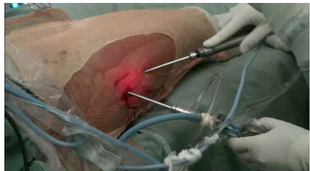
Fig. 1 With the patient in the supine position, the right hip is operated on. The STP is placed at the superior tip of the GT and the ITP is placed approximately 10 cm below the tip of the GT, in line with the axis of the femur.